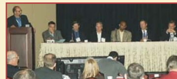
Grant Hill and faculty on symposium panel